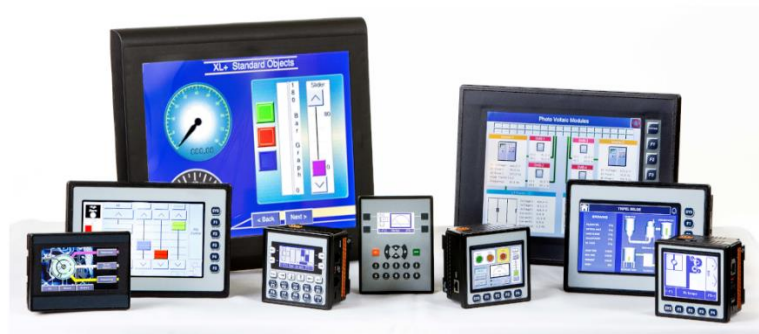
Figure 2 - The Horner OCS Range of PLC/HMI combined controllers

Download link: https://hornerautomation.eu/?cmdm_direct_download_id=160923